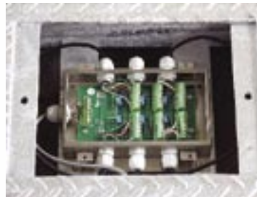
Stainless steel junction box located inside base. Entry is from top of scale.