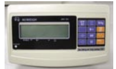
JAC 101 Electronic Indicator with a large easy to read display